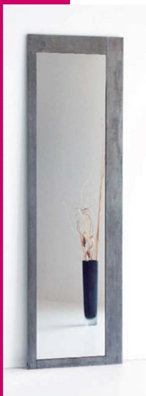
Specchio - Mira