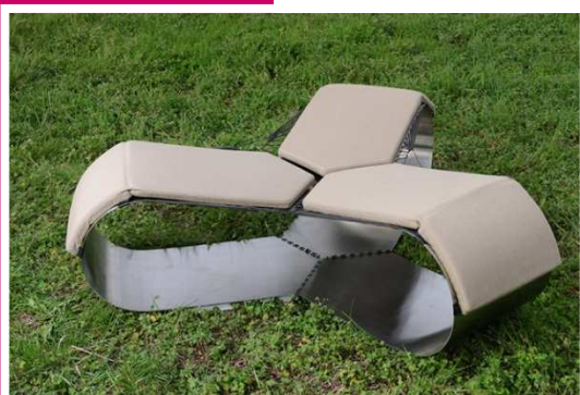
COCOON - chair