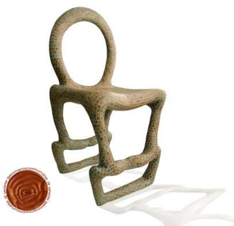
chair