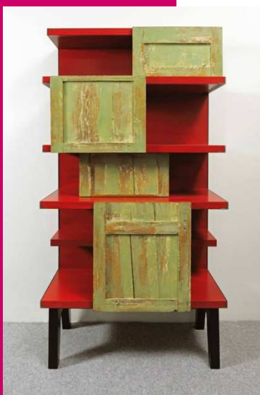
Unaportanonbasta - library