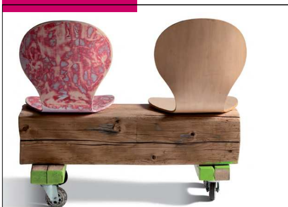
Salami chair - bench