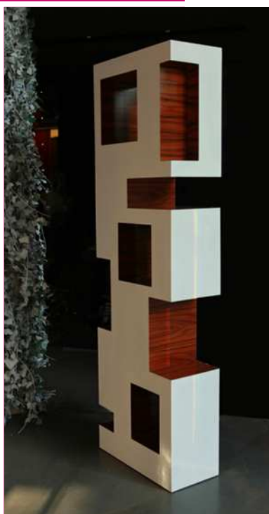
TOTEM - library