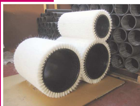
Roll 60 - chair